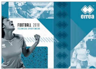
CATALOGO FOOTBALL 2018.pdf