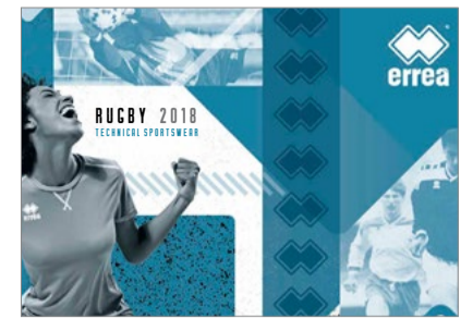
CATALOGO RUGBY 2018.pdf