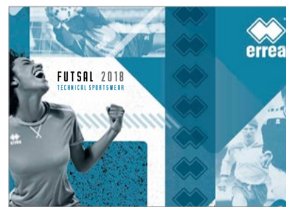
CATALOGO FUTSAL 2018.pdf