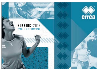
CATALOGO RUNNING 2018.pdf