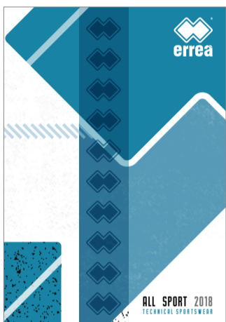
ALL SPORT 2018.pdf