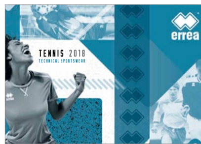
CATALOGO TENNIS 2018.pdf