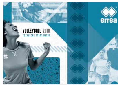
CATALOGO VOLLEY 2018.pdf