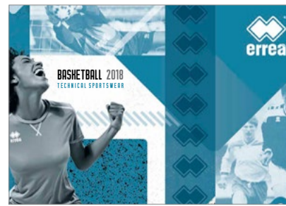
CATALOGO BASKET 2018.pdf